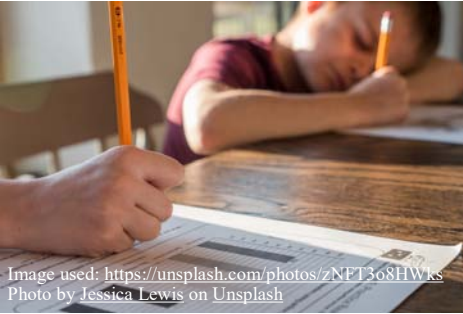
Image used: https://unsplash.com/photos/zNFT3o8HWks